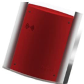
*Ruby Red optional colored base cover shown above