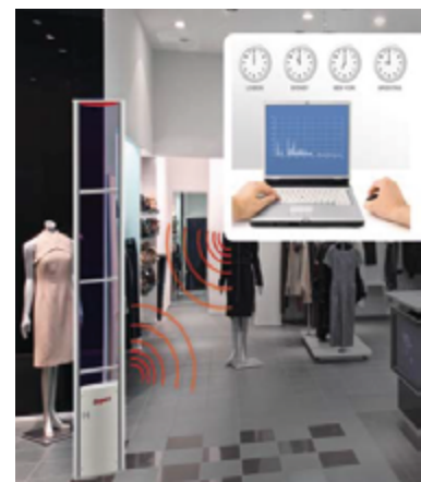
EVOLVE P30 without advertising panel inserts